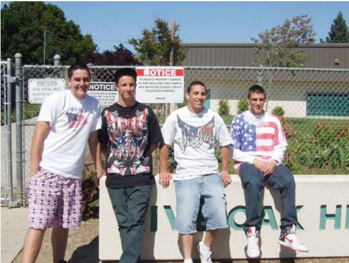
The four “Gringo” high school boys and their “offensive” shirts.