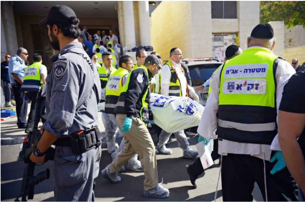
Bodies being removed from the synagogue after the slaughter of rabbis and policeman.