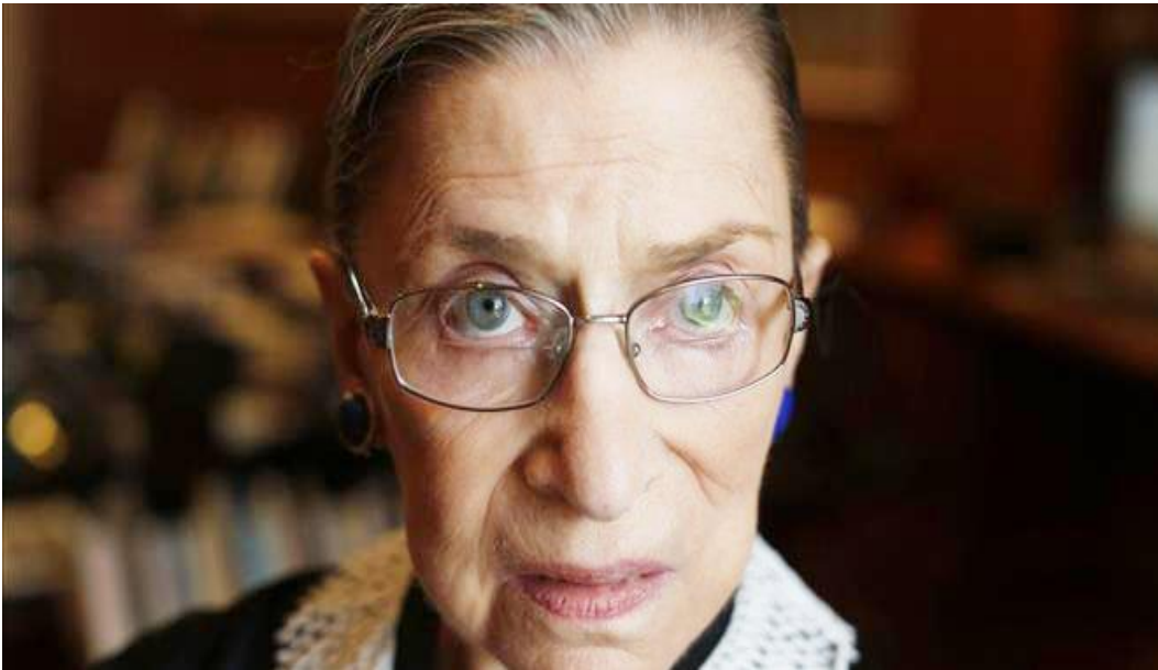
Supreme Court Justice Ruth Bader Ginsburg