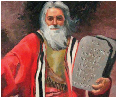
Moses and the Ten Commandments

In looking back at "The Good Word" of years gone by, we find that truth is timeless. The one below is from April/May 1997.